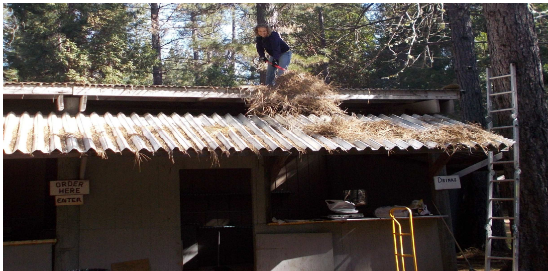
Rebecca on Concession Stand cleaning Pine Needles.